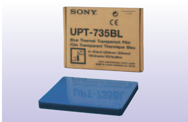
UPT-735BL Blue Thermal Film Printing Pack